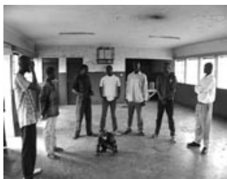
Publika na "Uradi sam" projekciji [Mathare, 23.05.2008.]