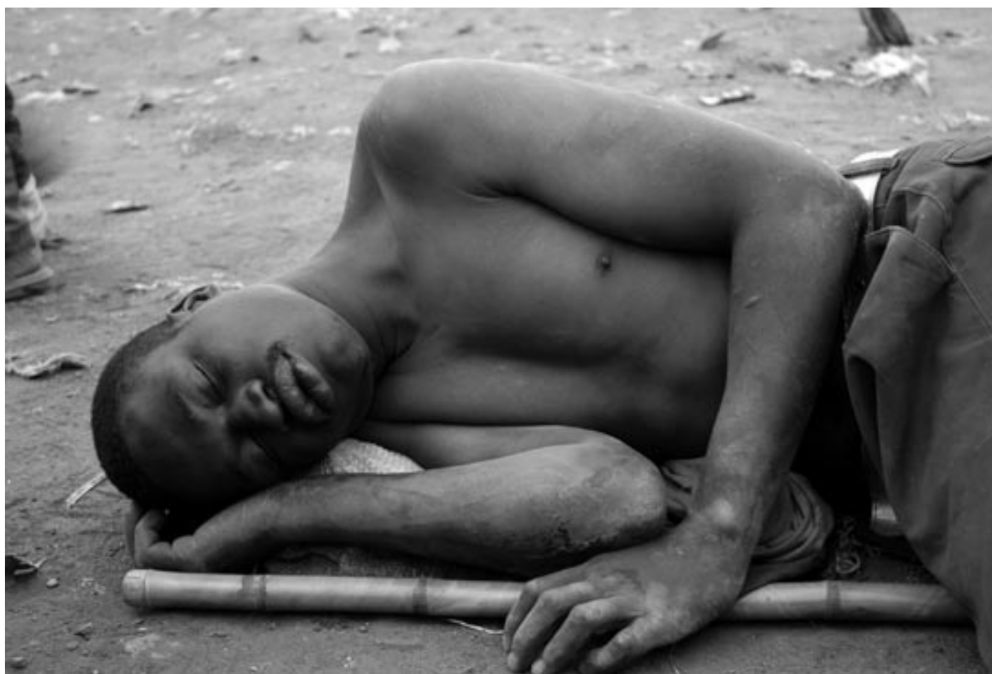
A drunk man at the DIY screening [Mathare, 23.05.2008]

- Oh, I go to Africa - he said. - To Kenya. - Really? What for? - Well, to make television - was his short answer.