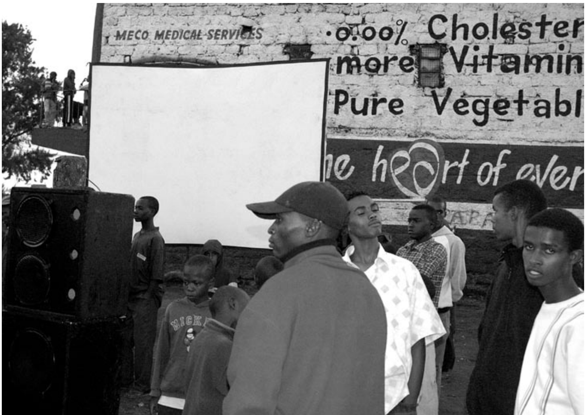
Organizacija projekcije Mir [Mathare 25.04.2008.]