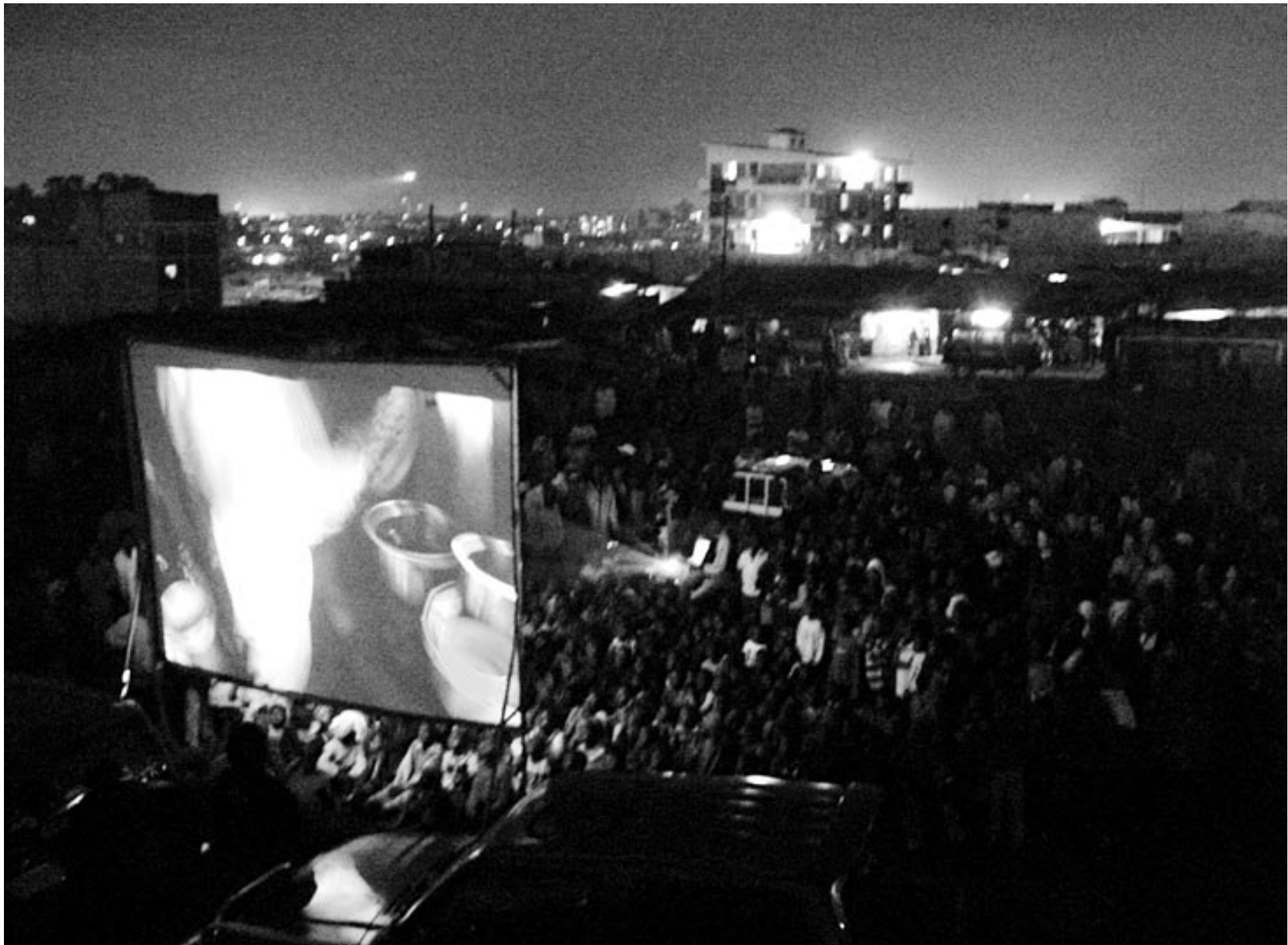
Audience at the screening of the Peace Newsreel [Mathare, 25.04.2008]