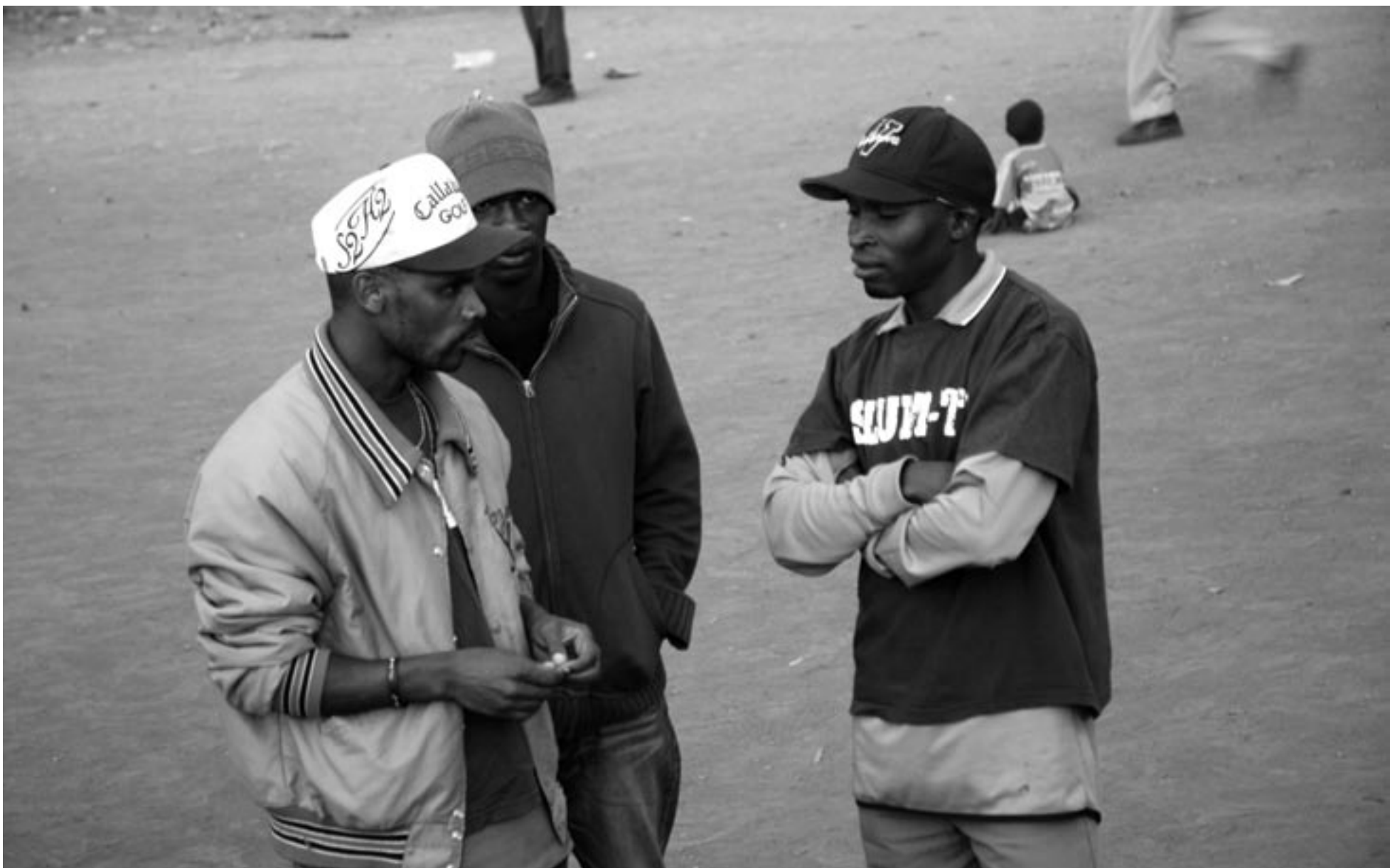
Deo lokalnog obezbeđenja za SLUM-TV [Mathare, 23.05.2008.]

Safari (izgovor: /sə'fari/) je vrsta kopnenog putovanja. Termin se obično odnosi na turističko putovanje u Afriku, tradicionalno zbog lova na krupnu divljač, a u modernijim vremenima zbog posmatranja i fotografisanja krupne divljači i drugih živih bića u divljini. Ova reč asocira na izvesnu temu ili stil, koji uključuje oblačenje u odeću kaki boje, posebne prsluke i opasače, takozvane safari šešire i kožu divljih životinja, kao što je, na primer, koža leoparda."