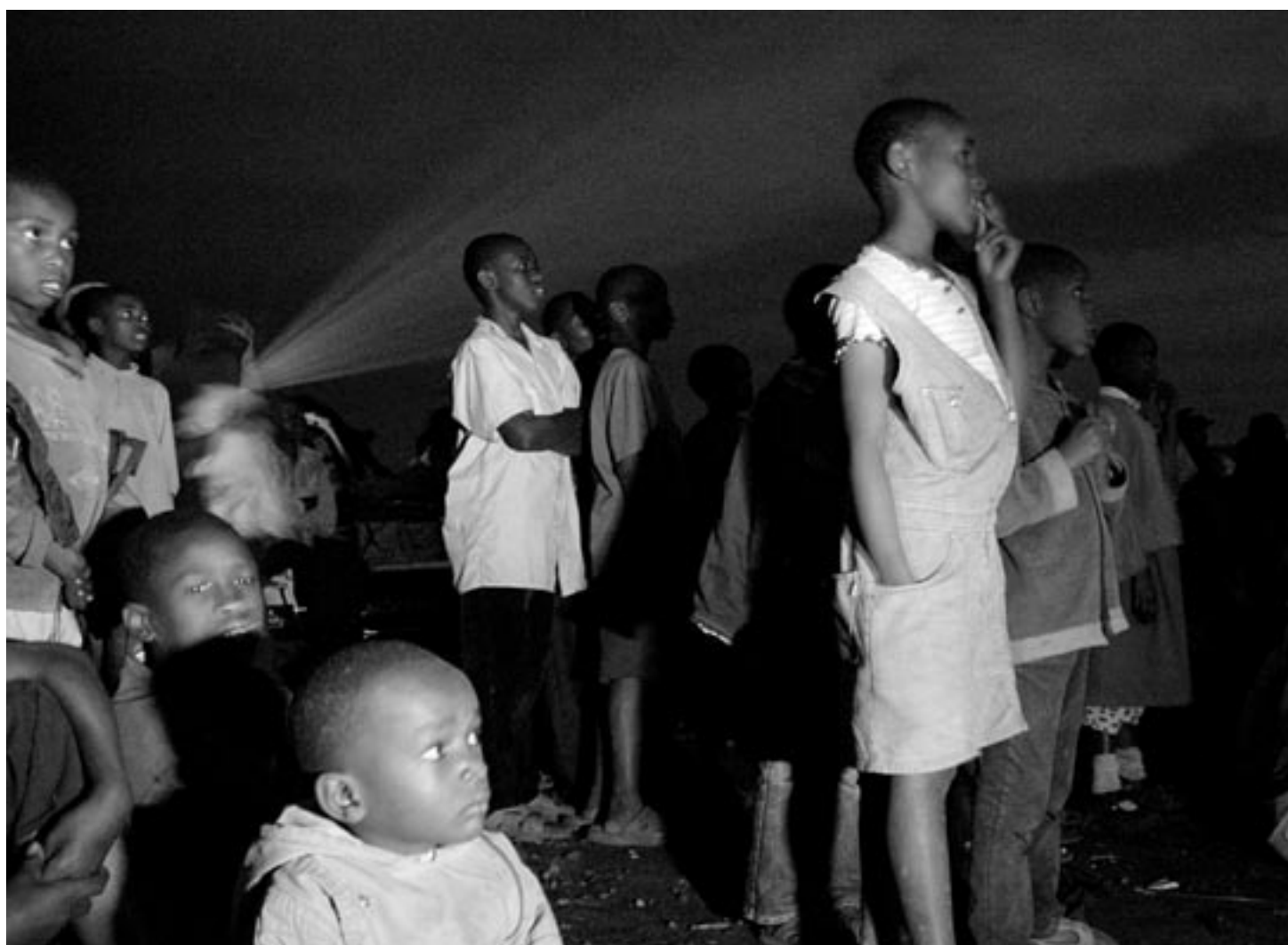
Audience at the public screening [Mathare, 8.10.2007]

The project Economy Class was the option to go to Nairobi, and the first reason. But i saw this project almost as a kind of complete performance, and behind the curtain, we can realise what we came for. I'm working for years with process-