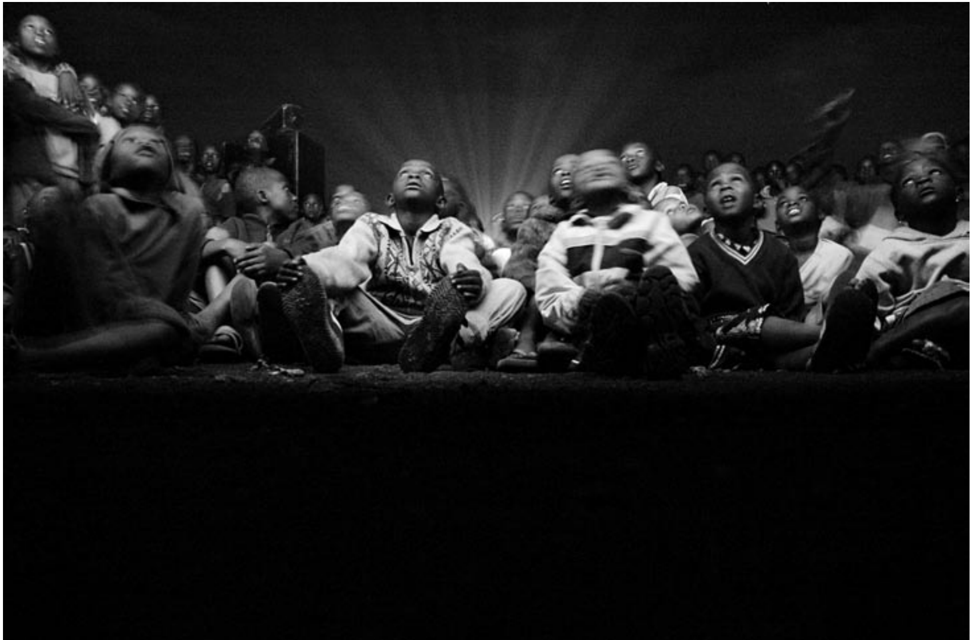
Publika na projekciji Reportaže mira [Mathare, 25.04.2008.]