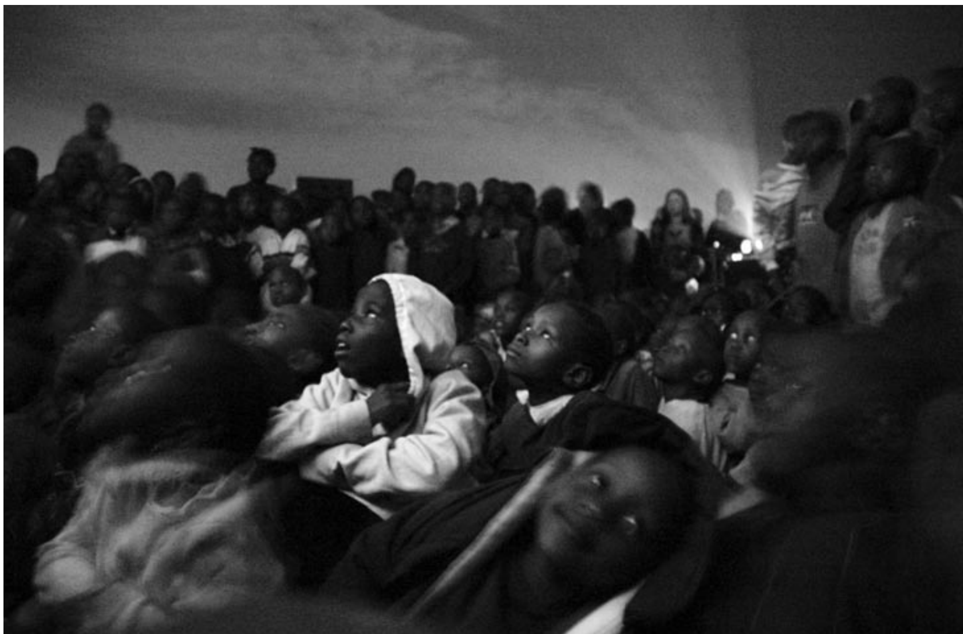
Audience at the DIY screening [Mathare, 23.05.2008]